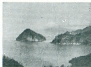
Made with "SERENAR" 50mm