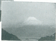
Made with "SERENAR" 135mm