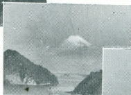
Made with "SERENAR" 100mm