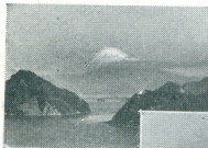
Made with "SERENAR" 85mm