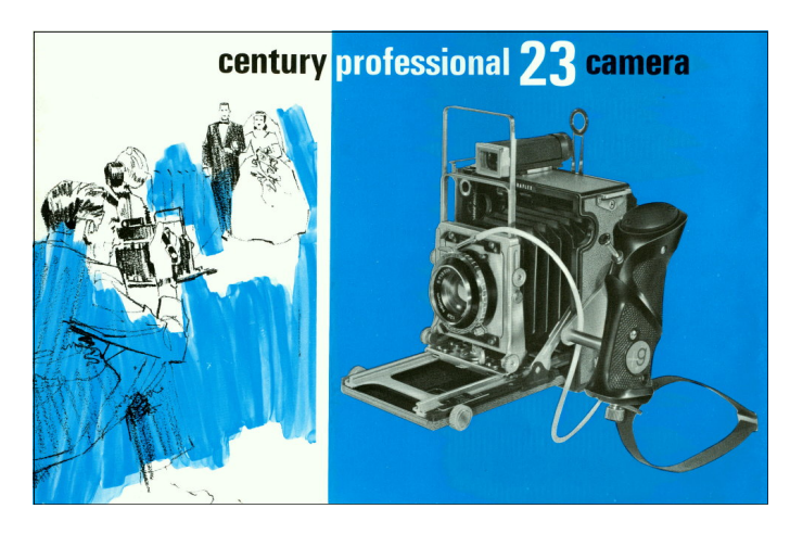
The Century Professional

[Ed. We encourage readers to submit articles about their experiences with Graflex cameras.]