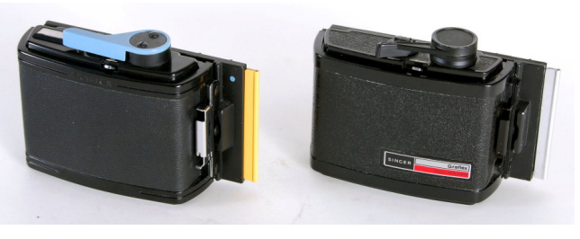
Left, RH/10 General Precision era Roll Holder. Shown is yellow dark slide handle, which is one of several colors that could be ordered for roll holders and film pack adapters. Right, Singer Pro Model II.

RH/10 Rapid-Vance Roll Film Holder (catalog number 1253, blue lever) Also, the RH/8 (red lever), RH/12 (green lever) and RH/20 (yellow lever) roll holders could be used on the Century or xl cameras. For the camera user, Bill Inman (<u>GHQ</u> Volume 7, Issue 3) recommends the Graphic Pro Model II (introduced in 1971 and bearing the Singer name on the case and carriage) as a much improved version. In Bill's opinion, the new roll holder dropped the color coded advance lever in favor of a black and silver lever to make the holder look more like a 35mm camera. From samples, it appears that some of the Model II roll holders had all-black advance levers.