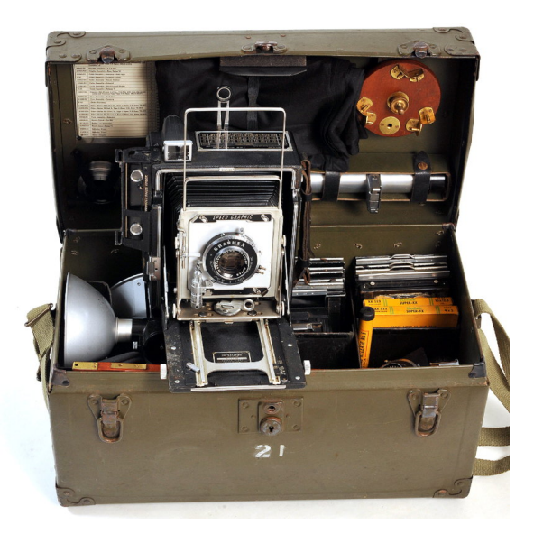
C-6 4x5" Pacemaker Speed Graphic

with "CASE TYPE C-3 CAMERA" proudly stenciled in white across the front. Inside was the camera, a Crown No. 1 wooden tripod, 3-cell Graflex flash, side extension flash, 7" and 5" reflectors, flash cords, six Graphic double-sided sheet film holders, a Graphic film pack adapter, lens hood and filter holder, filters, a black focusing cloth, and, in some outfits, a Bausch & Lomb 88mm wide-angle lens. There was also room for film, flash bulbs and a light meter. I swear every photographer finished the war 4" shorter after carrying that lot around!