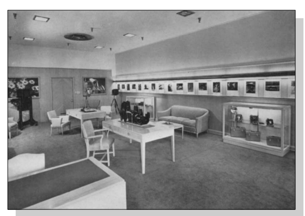
Wilshire Boulevard showroom.

While the showroom was the height of stylish design, the offices were scattered around the building, above and behind the show-