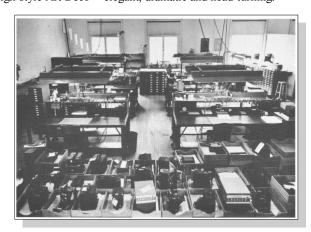
Wilshire Boulevard Service Department.

rescent lighting that silhouetted the letters at night. The effect was high-style Art Deco -- elegant, dramatic and head-turning.