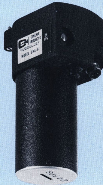
MODEL CRA-6 (24 fps)

Both CRA-6 and CRA-6/A motors are remarkably efficient! Current drain from standard Arri battery pack is less than 1½ amps . . . That's more than 15 thousand feet of film from a standard battery!