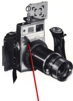
Quick Focus Lever

The illustration shows the Quick Focus Lever mounted in the most-used position. Set the focusing ring on the camera at the infinity position.