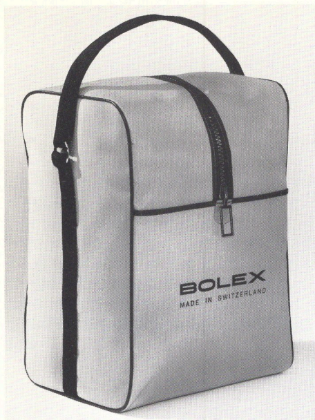
Skai carrying case.