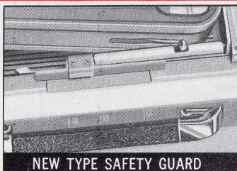
NEW TYPE SAFETY GUARD

A completely new 16mm magazine camera. Just 36 ounces of movie-taking ease and perfection . . . a camera that's years ahead in design and performance. New visor-type viewfinder . . . loads in seconds . . . interchangeable lens.