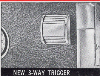
NEW 3-WAY TRIGGER