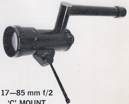
17-85 mm f/2 'C' MOUNT WITH ST'D OFFSET VIEWFINDER MODEL NO. RTH 130/112

The Monital lens is a well corrected zoom lens with an optical performance comparable to that of a good fixed focal length lens. The cameraman will find that it will make the most of today's modern fine emulsion films in black and white or color. This lens is rigidly constructed of high strength light weight aluminum alloy with a steel hard anodized finish. White scale marks engraved on the barrel make for exceptionally clear and easy reading of zoom, iris, and focus positions. The internal mechanism consists of a piston-like movement of the two elements that alter the focal length and ride in the lens barrel on low friction teflon slipper pads to virtually eliminate wear.