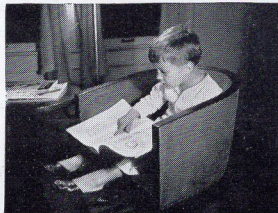
Above: Approximately one-half National GRAFLEX picture size.

The ENLARG-OR-PRINTER as an enlarger accepts for projection all negatives up to 2\frac{1}{4}" \times 3\frac{1}{4}" or that section of a 4" \times 5" . As a contact printer or retouching desk it accepts negatives up to 8" \times 10" —with the Extension Top, to 11" \times 14" .