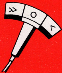
push-button remote control