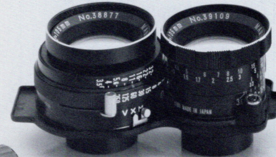
80mm f/2.8 Standard Lens Cat. No. 655509