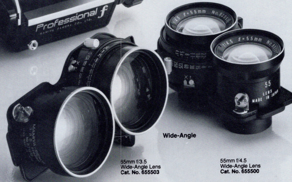
55mm f/3.5 Wide-Angle Lens Cat. No. 655503