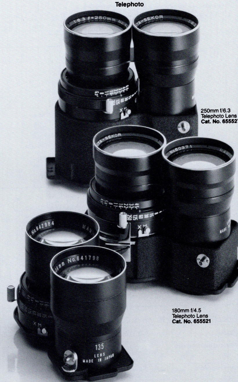
135mm f/4.5 Telephoto Lens Cat. No. 655515