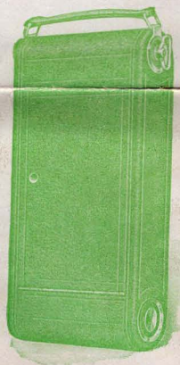
Folding Scout Closed

Ample focal capacity is provided for rendering pictures of correct proportions, while the choice of lens equipment is