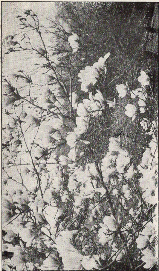
Magnolia Blossoms. Highland Park