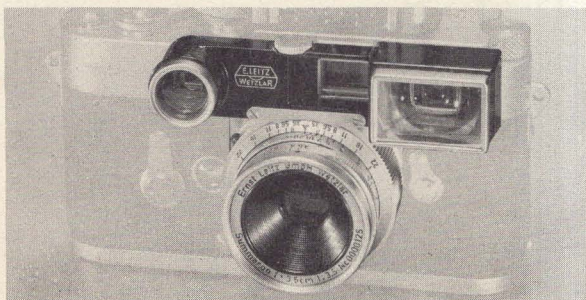
"RF" 35mm SUMMARON f/3.5 WITH OPTICAL VIEWING UNIT. #11,107

Another new lens is the "RF" 35mm Summaron f/3.5 wide-angle lens for the M-3 which functions in conjunction with the range- and viewfinder system of the M-3 Leica. This is a long awaited item, and unquestionably makes the already unique M-3 range- and viewfinder more versatile than before.