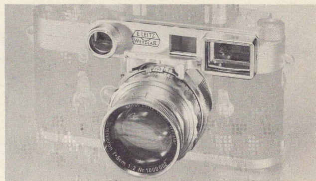
DUAL-RANGE 50mm SUMMICRON f/2 WITH OPTICAL VIEWING UNIT. #11,318

A leather case is available to hold the Dual-Range Summicron with its viewing unit, or the "RF" Summaron with its viewing unit plus the Summicron viewing unit. Also available is a case for the Summicron viewing unit only.