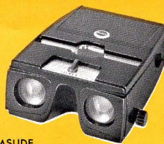
KODASLIDE STEREO VIEWER I

Safety Film Advance Locks shutter after each exposure to prevent accidentally taking one picture on top of another. Automatic Exposure Counter Shows the number of shots left after you take each picture. Film-Type Indicator Shows the type of film you have in the camera. Depth-of-field scale One lens is marked with the conventional distance scale (4 feet to infinity) and with a depth-of-field scale to show you what's in focus at any distance setting. Styling Attractively styled in rich two-tone brown with bright metal trim. Construction Novel techniques in camera design and manufacture have been used to produce a precision camera for top-quality color stereo pictures—at a price you can afford. Other features Adjustable neck strap, lens cap, and tripod socket.