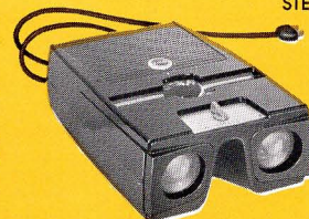
KODASLIDE STEREO VIEWER II

Your stereo slides take on a new brilliance and color clarity when you see them in lifelike 3 dimensions with a Kodaslide Stereo Viewer. Two superb models—the battery-operated Kodaslide Stereo Viewer I and the 110-volt Kodaslide Stereo Viewer II—each with its unique and exclusive features. Kodaslide Stereo Viewer I, $12.75; Kodaslide Stereo Viewer II, $23.75; Kodaslide Stereo Viewer Converter (converts Viewer I to 110-volt operation), $5.95.