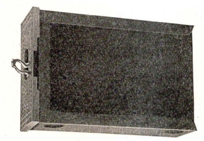
plate exposures. The operator has the choice of plates or film plates being recommended where the most delicate and perfect photographic effects are sought, film when an extended journey is contemplated; a camera which is indeed a revelation—an education in the possibilities of photography.

O be regarded as practically a pocket camera, yet carrying twenty-four film exposures or twelve