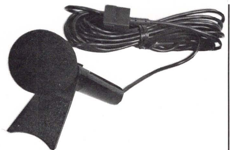
□ □ ☆ C53-9251-001 Dynamic Microphone DM30R for AF514XL-S, 514XL-S & 312XL-S

This lens may be used with the Canon 1014XL-S and 814XL-S models to increase their close-up capability dramatically, allowing much greater magnification than their built-in macro lenses provide.