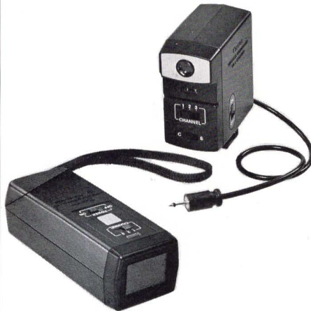
◎◻●○◻☆ C58-5351-211 Wireless Controller LC-1 Set (Consists of LC-1 Transmitter and LC-1 Receiver)

This Extension Cord is used in conjunction with either Remote Switch 60 or Remote Switch 3. It is ten meters long. It may be used in multiples for candid filming.