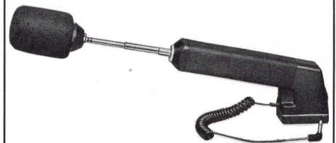
⊙ □ □ ☆ C53-9254-011 Boom Microphone BM70

The DM 40 R is a high-quality hand-held microphone designed for recording conversations or narration. It is omnidirectional and has a built-in wind-screen.