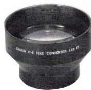
⊙ C54-3701 C-8 Tele-Converter 1.4X 67

When used with the Canon 1014XL-S or 814XL-S cameras, this lens shortens the focal length of their lenses to 4.3mm and 4.5mm, respectively, for greater wide-angle effects.