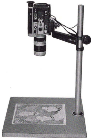
5-20601-20 Copy Stand 4

The Copy Stand 4 is used with the Canon Super 8 cameras principally for animation and titling. It provides a stable, convenient and versatile platform for critical work.