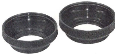
⊙ C44-6201 Rubber Hood SC-62 for 814XL-S

When used with the Canon 1014XL-S or 814XL-S camera, this lens increases the focal length of their lenses to 91mm and 78.4mm, respectively, for greater telephoto effects.