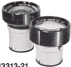
○ ▲ 5-43313-21 Canon C-8 Tele Converter Lens 1.6X

This telephoto conversion lens increases the telephoto range of the AZ512XL's and AZ518SV's lens to from 15.6-78mm. It is highly useful for extreme telephoto applications, such as sports or nature photography.