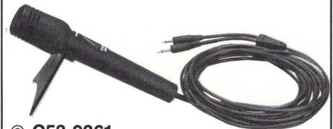
⊙ C53-9361 Dynamic Microphone DM 40 R

This sensitive dynamic microphone is standard equipment for general sound filming and is supplied with the AF514XL-S, 514XL-S and 312XL-S Canosound cameras. It is also for use with the PS-1000 Canosound projector or any equipment where a high-quality omnidirectional mike is needed.