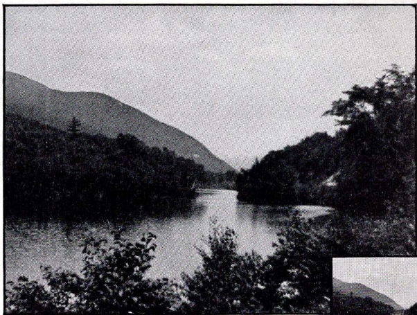
Actual size of Memo picture as taken, and enlargement.