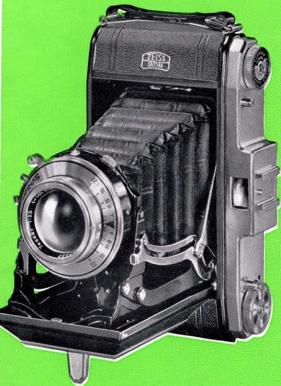
IKONTA II-C, 2 1/4" x 3 1/4"