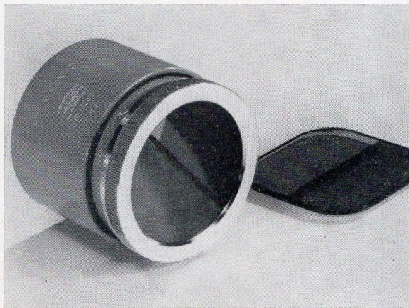
Sterikon 10a for Ikolux 300