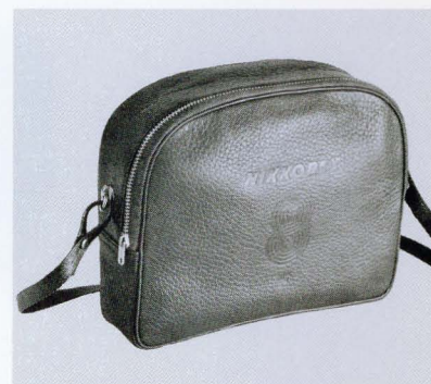
SOFT ZIPPER CASE Cat. No. 12407 Top-grain leather with shoulder strap. Holds camera with zoom-conversion lens.

BATTERY TESTER Cat. No. 12520 Plugs into remote control socket for instant check on condition of film-drive batteries.