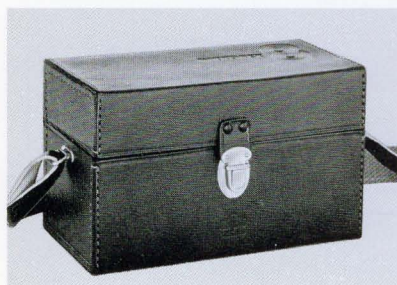
DELUXE COMPARTMENT CASE Cat. No. 12403 Hard, top-grain leather with shoulder strap. Holds camera, zoom-conversion lens, remote control, battery tester, filters, spare film and batteries.