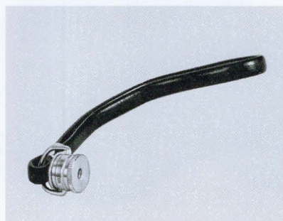
WRIST STRAP Cat. No. 12500 Sturdy leather strap with swivel attachment that screws into tripod socket. Convenient for carrying camera and for steadying it while filming.