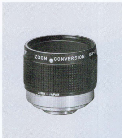
ZOOM-CONVERSION LENS Cat. No. 12110 Screws into camera lens and converts it into zoom system with range from 8mm true wide angle to 20mm telephoto. Pre-focused for universal sharpness at all focal lengths and all distances to 3 feet. Supplied with leather case.