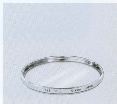
FILTERS 40.5mm screw-in for 48mm lens: Cat. No. AC2208, medium yellow; Cat. No. AC2209, green; Cat. No. AC2259, red; Cat. No. AC2210, orange; Cat. No. AC2211, UV haze; Cat. No. AC2212, 85 conversion; Cat. No. 2214, 82A color compensating; Cat. No. AC2213, skylight.

Both may be used in combination for shooting as close as 9.88", covering subject areas as small as 3.26 x 4.9"