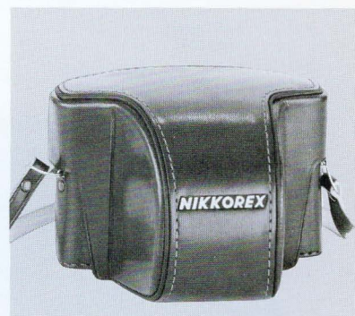
LEATHER EVEREADY CASE Cat. No. 10405. Top-grain cowhide, with adjustable shoulder strap. Built-in camera retaining screw is threaded so camera can remain in case when used on tripod.