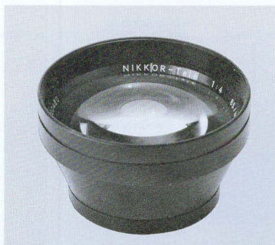
85mm f4 NIKKOR TELEPHOTO CONVERSION LENS Cat. No. 10302. Screws into 48mm camera lens. Gives almost 1.8x magnification and 27° angle of view. Automatic diaphragm remains operative. Supplied with lens caps and leather case.