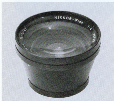
35mm f4 NIKKOR WIDE-ANGLE CONVERSION LENS Cat. No. 10252. Screws into 48mm camera lens. Provides 63° angle of view and increased depth-of-field. Automatic diaphragm remains operative. Supplied with lens caps and leather case.