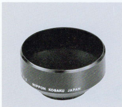
LENS HOOD Cat. No. 10602 40.5mm screw-in for 48mm lens. Supplied with case.