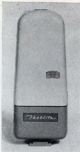
The Ikoblitz closed.