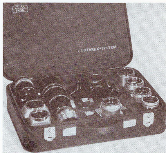
The attractive Contarex Display Case.

Here are the items which comprise the complete Contarex system