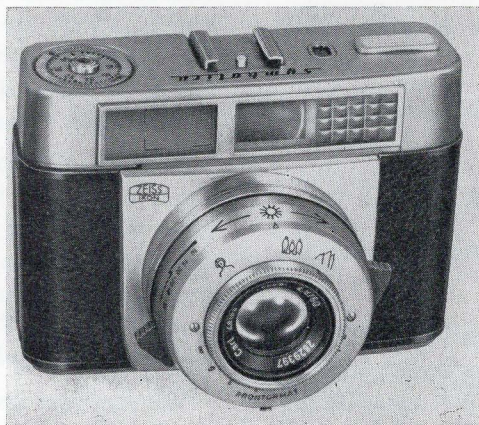
The new Symbolica II camera.

After the light intensity has been measured with the exposure meter needle in the viewfinder, the most favorable combination of shutter speed and lens opening is set AUTOMATICALLY . PHOTOGRAPHY WITH THE NEW ZEISS IKON SYMBOLICA II IS AS SIMPLE AS THAT