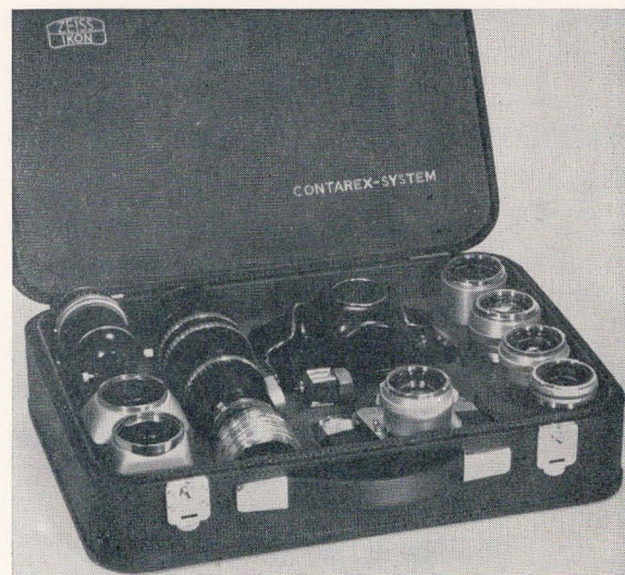
The attractive Contarex Display Case.

Here are the items which comprise the complete Contarex system